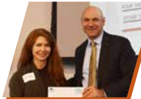
Advanced Integrative Wellness was awarded $4,000 in the Start-up-Ideation Category.

Congratulations to SCORE Client of the Year winners. Kemba Credit Union is proud to support SCORE Mentors Greater Cincinnati, which fosters vibrant small business communities through mentoring and education.