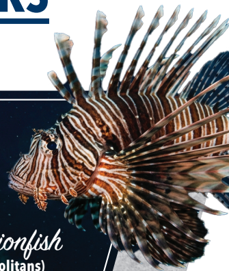
Red Lionfish (Pterois Volitans)